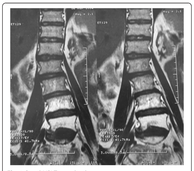
Fig. 3 Spinal MRI T2-weighted sequence