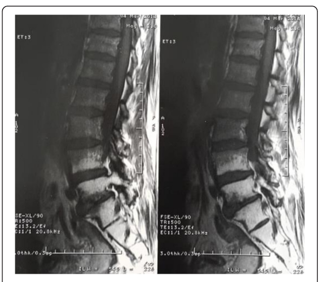
Fig. 1 Spinal cord MRI T1-weighted sequence

Five months post-treatment the patient's symptoms have stabilized without significant improvement in her lower extremity weakness, at the time of this report, she